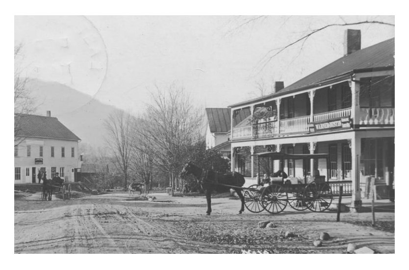
Former Aylesworth's Tavern, East Arlington, opened ca 1797.