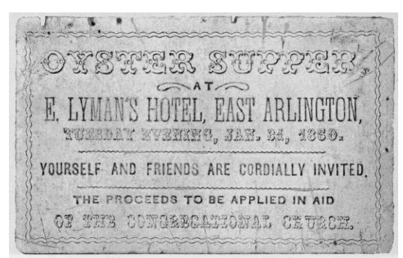
Ticket to fund-raising dinner at Lyman's Hotel , earlier known as Aylsworth Tavern , later as Green Mountain Hotel , January 1860.