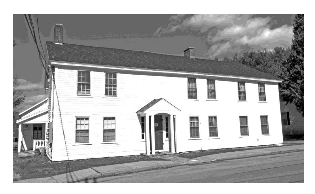
Abel\ Aylsworth\ Tavern\ /\ Green\ Mountain\ Hotel,\ ,\ now\ apartments,\ about\ 2014.