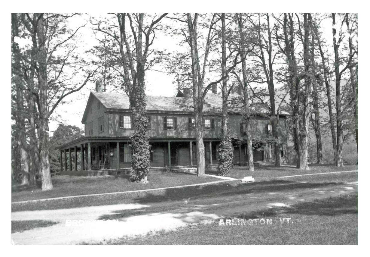
Deming Inn when it was known as the Bronson Inn. Note the extended front and side porch.