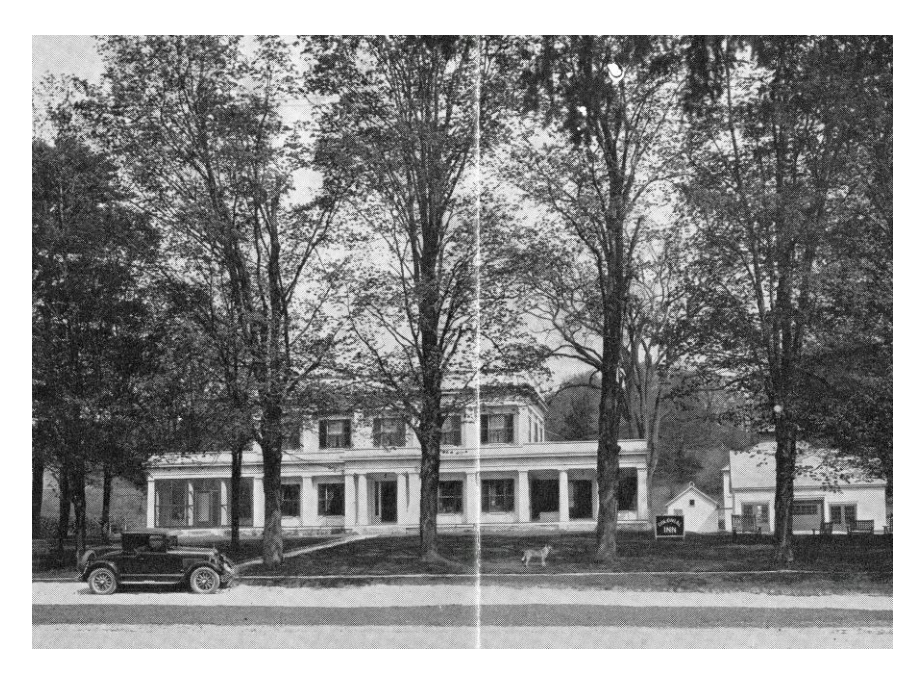
Colonial Inn, now the Arlington Inn, ca 1930s.