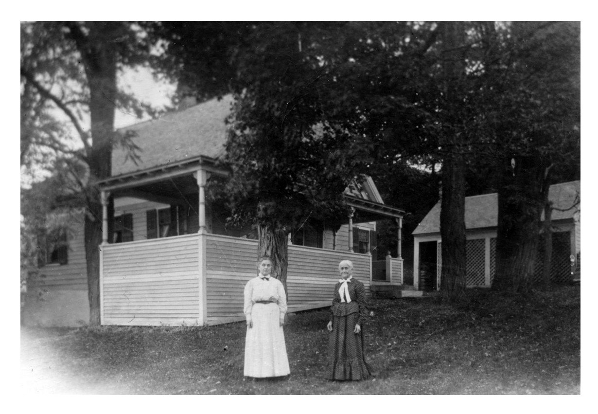
Hawley / Crofut House, Abel Hawley Tavern, established 1773.