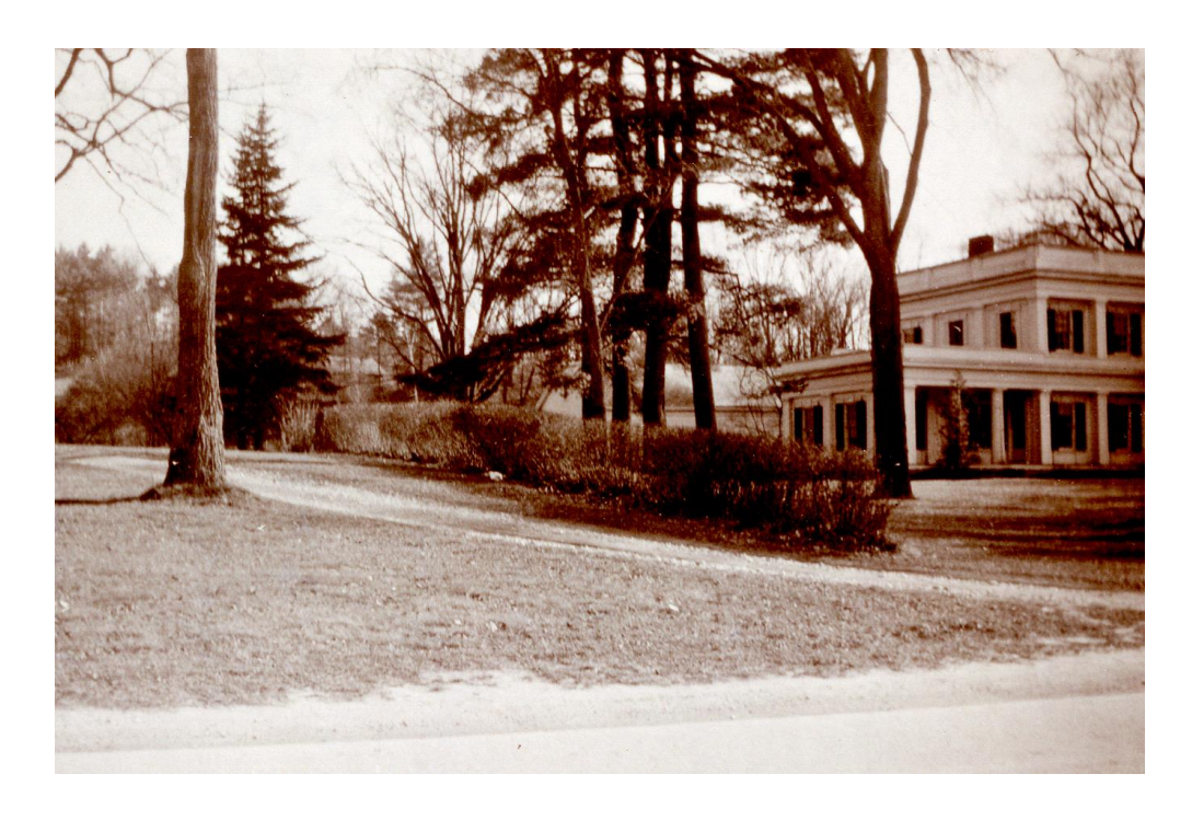
The Elnathan Merwin Tavern (1782) was located just north of today's Arlington Inn at the corner of Main Street (Route 7A) and Water Street (Route 313 west).