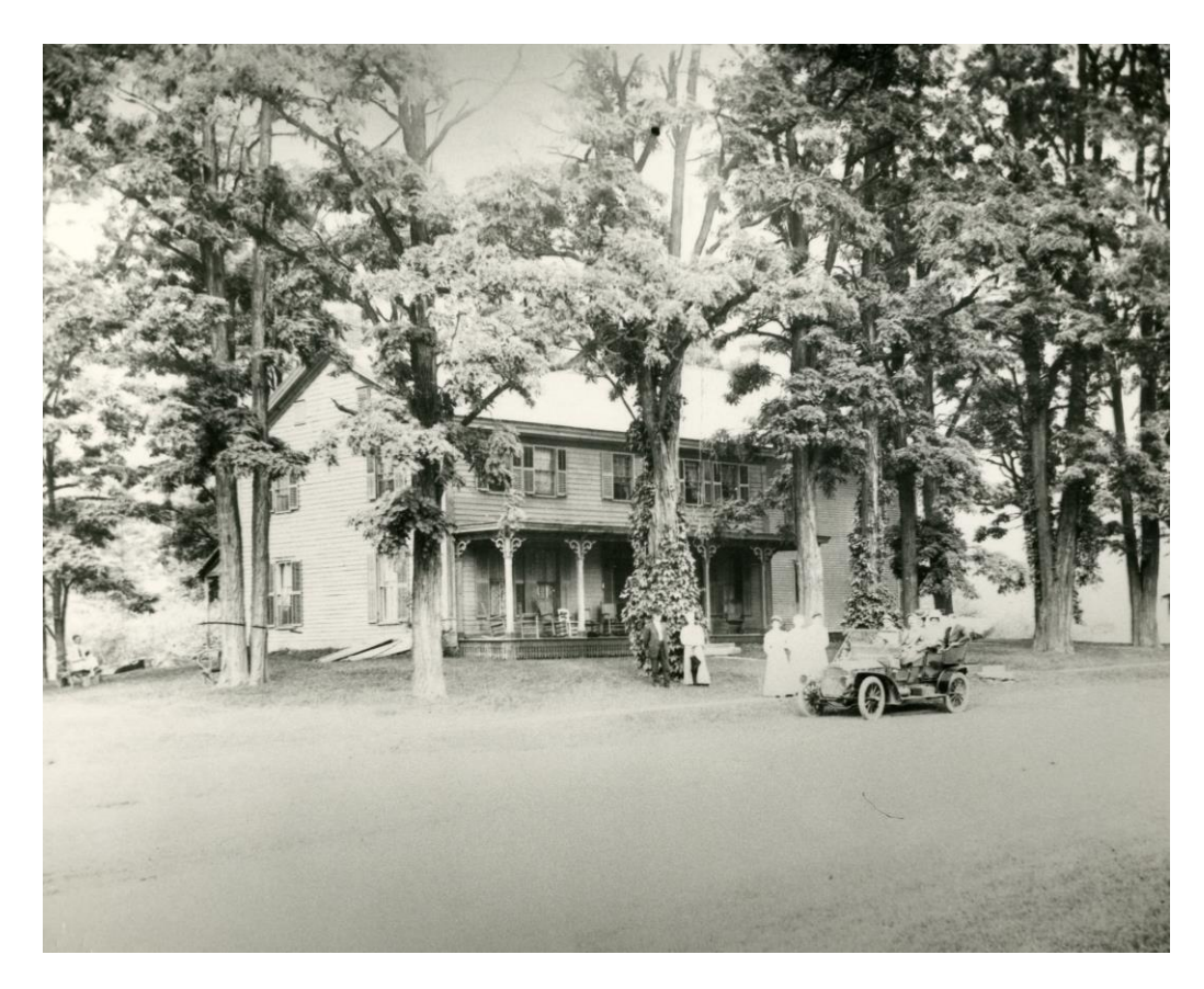
Deming Tavern / Bartlett House ca 1910.