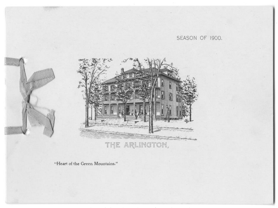
1900 advertising brochure for The Arlington .