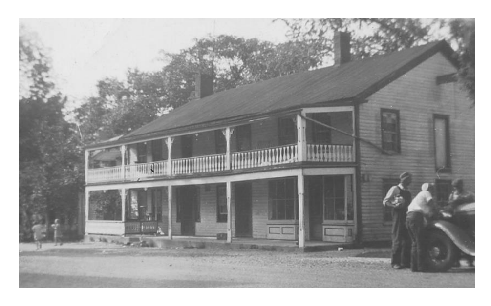
Abel Aylsworth Tavern / Green Mountain Hotel, 1930s.