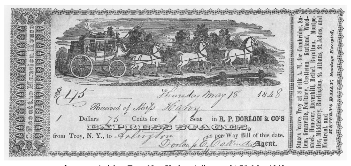
Stage coach ticket, Troy, New York to Arlington, $1.75, May 1848.