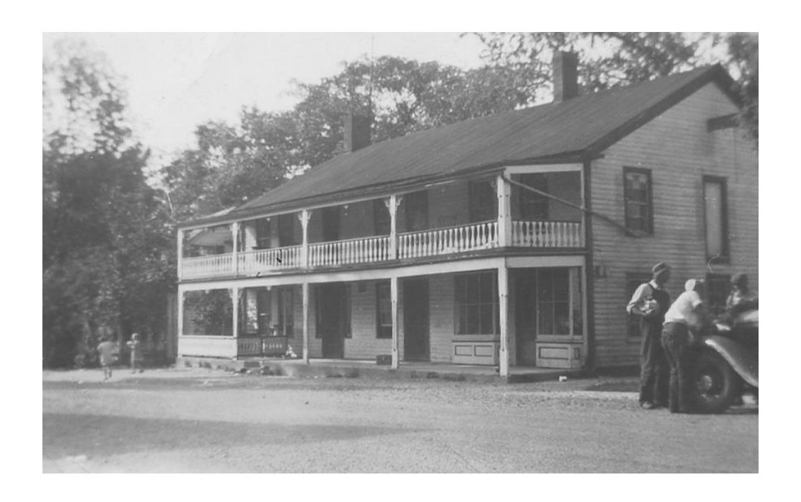
Abel Aylesworth Tavern, later Warner's 5 - 10 and Ice Cream, apartments.